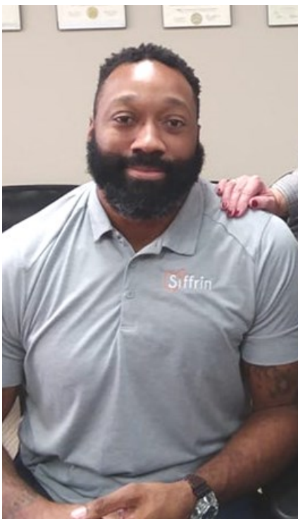
November 8, 2021